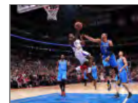
NBA Team Recap - March 4, 2013