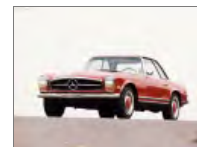
Top 10 Rides Of The '60s