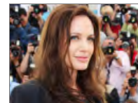
Celebrity Baby Bumps