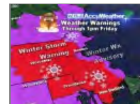
March Storm Forecast Maps